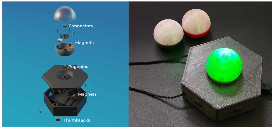
Fig. 2. Left: 3D model render of components; Right: Study Marbles prototype with an inserted illuminated color marble.

two different types of marbles with the same design. However, there was one difference: the color marble lights up when it is attached to the necklace; while the action marble used for the discussion and vote mode does not, it lights up only when it's your turn or you have voted. We designed three use cases for it: