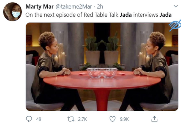
Fig. 4. Photo guided concept: the screenshot featuring the photo guided concept.