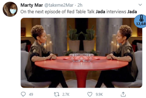
Fig. 3. Numerical value guided concept: the screenshot featuring the numerical value guided concept.