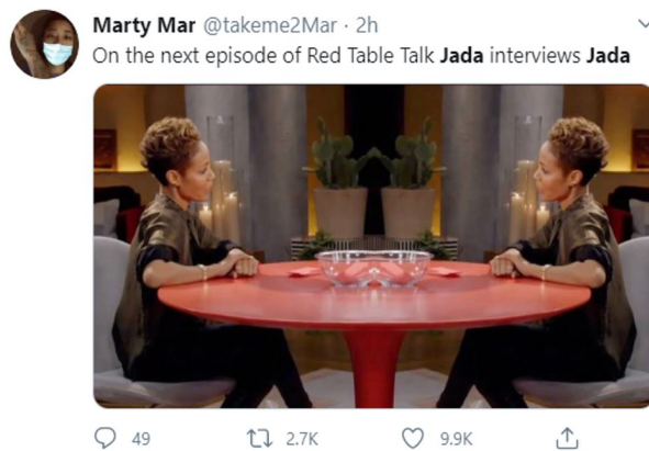
Fig. 5. Twitter default concept: displays the screenshot with Twitter's default concept.