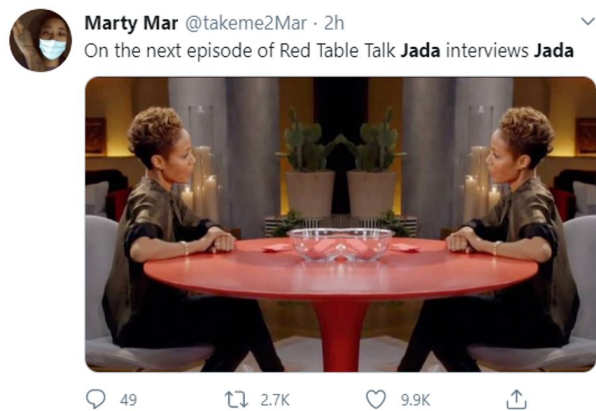
Fig. 5. Twitter default concept: displays the screenshot with Twitter's default concept.