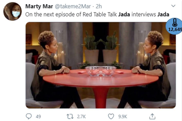
Fig. 3. Numerical value guided concept: the screenshot featuring the numerical value guided concept.