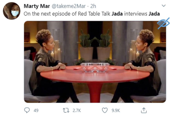
Fig. 4. Photo guided concept: the screenshot featuring the photo guided concept.