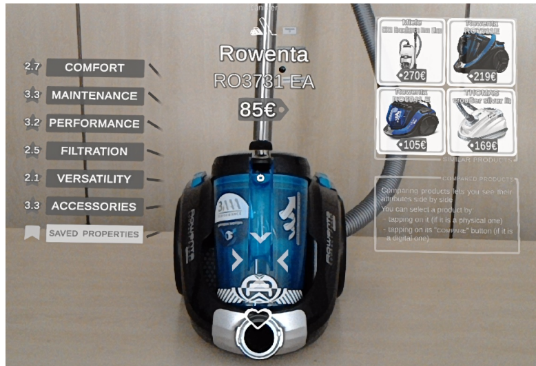
Fig. 1. Main view of the system. Attribute categories and recommendations are placed on the left and right sides of the product.