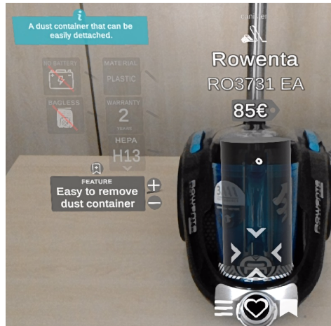
Fig. 2. Selecting an attribute shows its location on the product, a brief description and critiquing buttons (+/-).