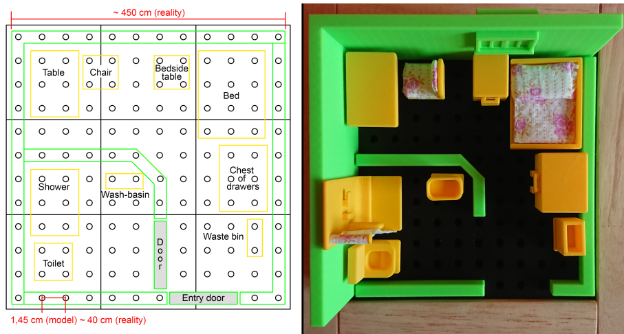
Fig. 2. Basic High-Fidelity prototype – Interactive modular tactile map of rooms

In comparison to the initial design, this High-Fidelity prototype consisted of modules as depicted in Fig. 2. There were nine modules, each with 16 holes (4x4). A matrix keyboard and micro-controller (ATTiny 48) were embedded into each module. All modules were connected to allow communication with a