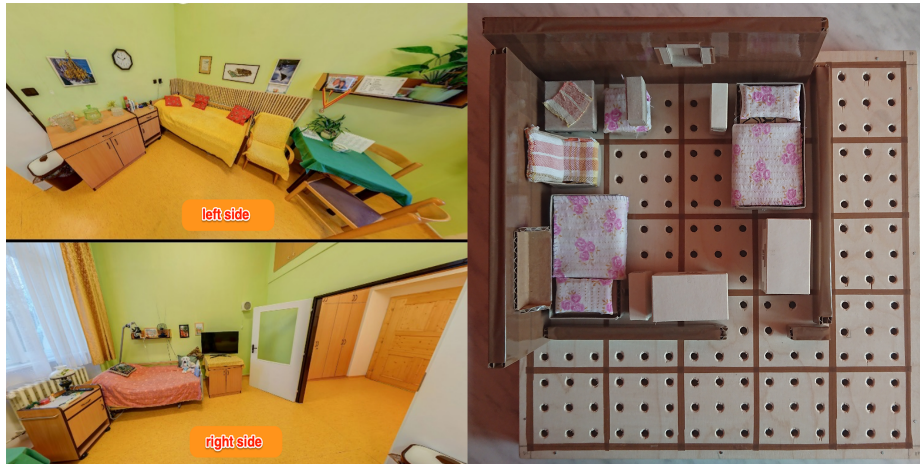
Fig. 1. Reference room (left) and Initial design Low-Fidelity prototype (right)

We propose an interactive modular tactile map that represents the indoor environment. It can represent a room (or few rooms when needed) and interior objects, including furniture and equipment like sinks, toilets, or even inner walls.