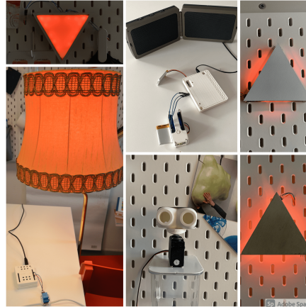
Fig. 2. Actuator artefacts

The following interfaces serve as a starting point -