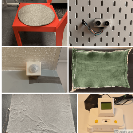
Fig. 1. Sensor artefacts

The technological aspects of these interfaces were kept as hidden as possible, to avoid prejudicing the inhabitants towards treating the object as a commodity. The emphasis is upon natural physical interaction with natural materials. This was deliberately done to invoke a sense of familiarity with the objects and the space itself, a principle taken from the interview recommendations.