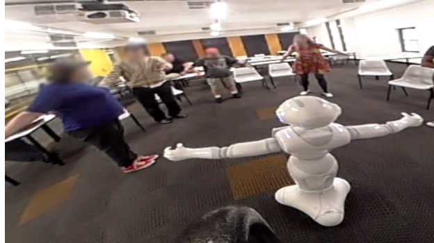
Fig.3. Pepper robot exercise application trial.