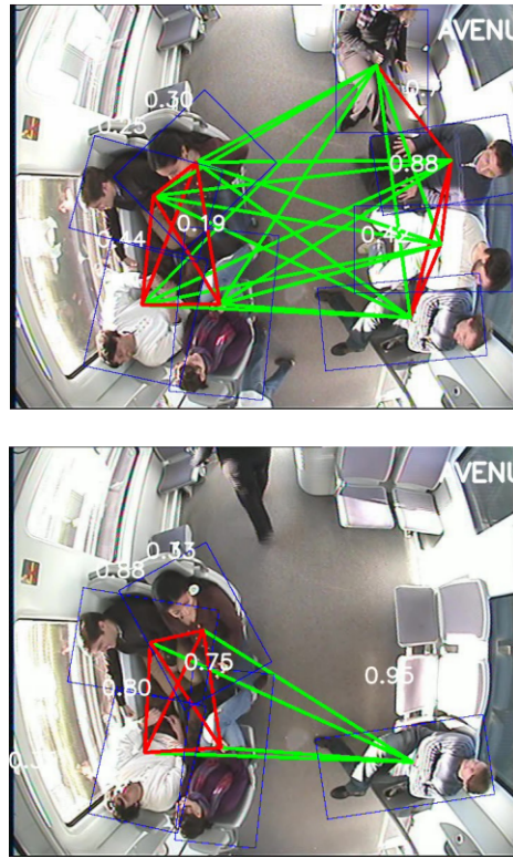
Fig. 3. Results on an unseen crowded scenario from the BOSS dataset, with overlapping detections