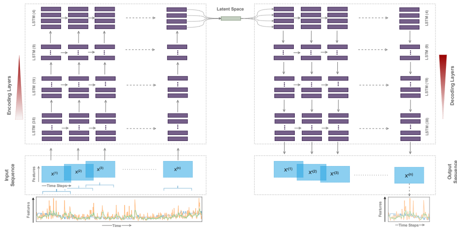
Fig. 1. Architecture of the LSTM Autoencoder used in the experiments.

As a result, in the anomaly detection pipeline, we used this family of algorithms as the fundamental training architecture. Autoencoders are technically unsupervised learning methods, as they do not require labelled data. For the purpose of anomaly detection, a part of the data which is assumed as normal data and doesn't contain anomalous samples is considered for training, therefore, the method is a semi-supervised method in the context of anomaly detection. An LSTM Autoencoder uses an Encoder-Decoder LSTM architecture to construct an autoencoder for sequential data. In the architecture shown in Fig. 1, a LSTM