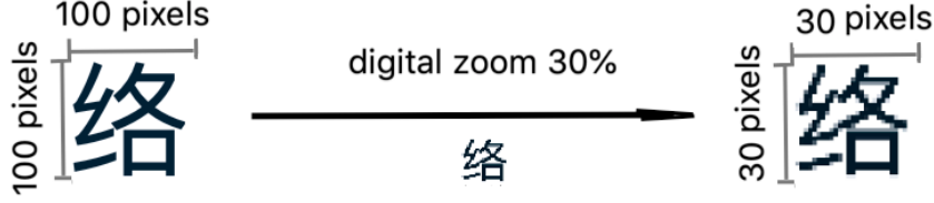
Figure 2: Illustration of the degradation of the image quality after the zoom 30%

of the size 100 \times 100 pixels and the scaled images the size 75 \times 75 pixels, 50 \times 50 pixels and 35 \times 35 pixels, respectively. The total number of images in the training set is 32. The matrices A \in \mathbb{R}^{N \times n} and B \in \mathbb{R}^{N \times 1} are selected randomly with N = 8 . The matrix C \in \mathbb{R}^{k \times N} is obtained by means of least square optimization on the training set. The trained homogeneous ANN has been tested on images, which are scaled (zoomed) to 30\% + i10\% with i = 0, 1, \dots, 17 . Notice that the decrease of the size of the nominal image implies a degradation of the image quality (see Figure 2). l scaled images have been successfully recognized.