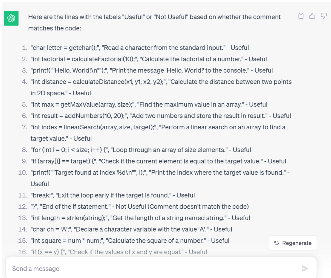
Figure 2: Example of ChatGPT Ggenerated Data

The Voting Classifier is based on 3 estimator models: a Random Forest, a Neural Network and a Linear SVC. The Random Forest has the following parameters: number of estimators = 100, criterion = gini, minimum samples split = 2, minimum samples leaf = 1, maximum features = sqrt, bootstrap = True. The Neural Network has the following configuration: number of hidden layers = 2, hidden layers sizes = (20,10), activation = relu, solver = adam, alpha = 0.0001, learning rate = constant, initial learning rate = 0.001, maximum iterations = 200, shuffle = True, tolerance = 0.0001, momentum = 0.9, nesterov's momentum = True, beta 1 = 0.9, beta 2 = 0.999, epsilon = 0.00000001. The Linear SVC is configured as follows: penalty = L2, loss = squared hinge, dual = True, tolerance = 0.0001, C = 1.0, fit intercept = True, maximum iterations = 1000. The voting strategy is set to hard.