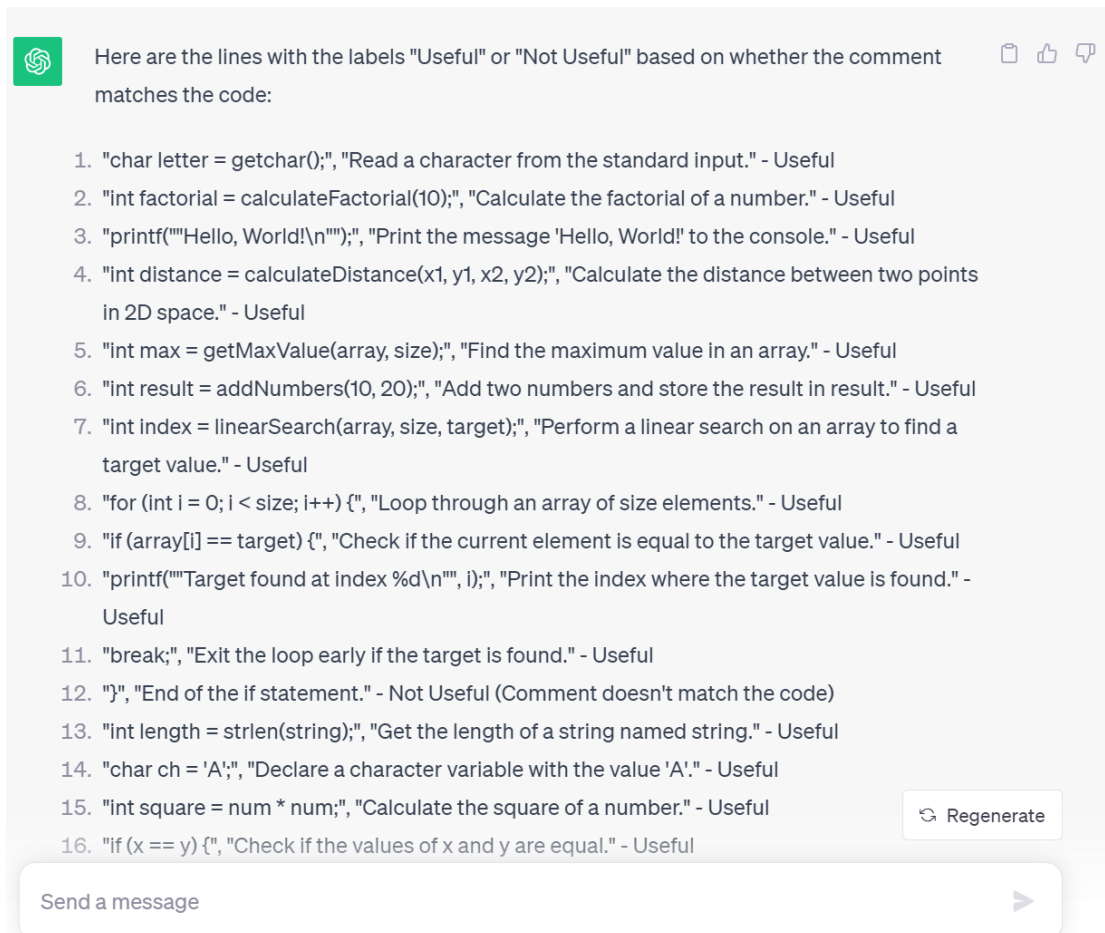
Figure 2: Example of ChatGPT Ggenerated Data

The Voting Classifier is based on 3 estimator models: a Random Forest, a Neural Network and a Linear SVC. The Random Forest has the following parameters: number of estimators = 100, criterion = gini, minimum samples split = 2, minimum samples leaf = 1, maximum features = sqrt, bootstrap = True. The Neural Network has the following configuration: number of hidden layers = 2, hidden layers sizes = (20,10), activation = relu, solver = adam, alpha = 0.0001, learning rate = constant, initial learning rate = 0.001, maximum iterations = 200, shuffle = True, tolerance = 0.0001, momentum = 0.9, nesterov's momentum = True, beta 1 = 0.9, beta 2 = 0.999, epsilon = 0.00000001. The Linear SVC is configured as follows: penalty = L2, loss = squared hinge, dual = True, tolerance = 0.0001, C = 1.0, fit intercept = True, maximum iterations = 1000. The voting strategy is set to hard.