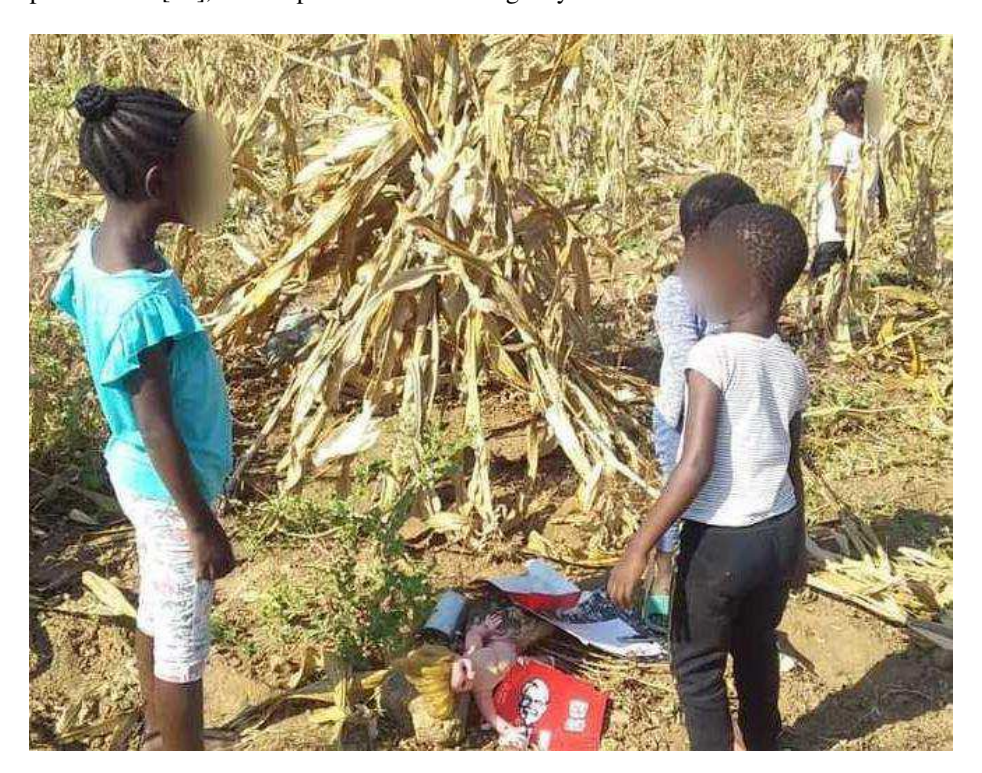
Fig. 2. Children from Mamaila playing Mandhwane.

their education systems [32]. The customary educational practice supports the principles that, Adeyemi and Adeyinka (2002) [2] propose, characterize African onto-epistemology including communalism, through collective learning; preparationism by role modelling; functionalism by imitating; holisticism through multiskilling; and perennialism by preserving culture. Mandwhane has, however, been underappreciated as a creative pedagogy, or an approach to learning that integrates problem solving and responds to political and psychological as well as the social aspects of people's development. Treating children as human beings who are free to express themselves in settings they create themselves and who know what is right and wrong without paternalism [19], indeed promotes creative agency.