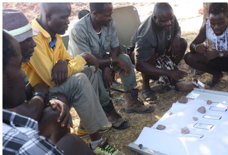
Fig. 2: Co-designing WAR app

guards deem as necessary for a wildlife data collection tool. Thereafter, the features were sketched on paper, offering the game guards a visual representation of the WAR app. Features include custom icons, custom buttons, a camera module and a voice recorder, necessitated by the low literacy rate and overall preference of visual and audio among the game guards. The icons designed represent various wildlife, activities and local practices, thus meaningful and aligned to the local conservation practices and wildlife that the game guards are accustomed to. An automated location tracker and date and time picker were also incorporated, after the game guards detailed the challenges they faced reading conventional maps, and identifying conventional date and time, which are auxiliary tools for the use of the Event Book.