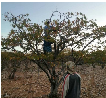
Fig. 4: Installing camera trap