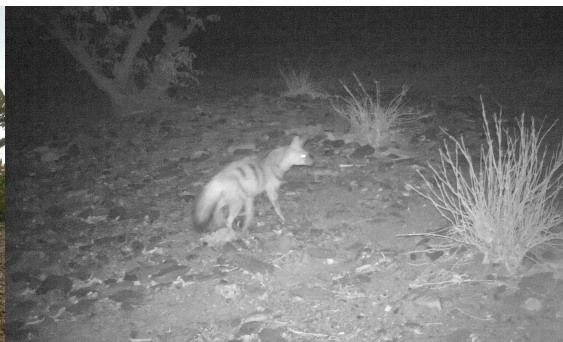
Fig. 5: Camera trap image