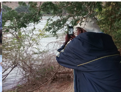
Fig. 3: WAR app in use

The WAR app has been used in different scenarios; HWC incident recording, encroachment, conservancy meetings, game patrols and predator sightings, with specific focus on capturing scarce carnivores - lions, cheetahs, hyenas and leopards. Imperatively, the game guards affirmed the above affordances as essential in eradicating HWC. During use, the game guards affirmed the app's appropriateness. Stating that it is their 'memory', as they store and reference what they have seen through the app. Images taken with the app serve as evidence of transgressions against wildlife, for which if there was no visual evidence would have gone unpunished, which is a common occurrence in conservancies. The app achieves additional pertinence through its instant data sharing and amalgamation abilities. The data is decisive for determining wildlife behaviour and phenology indicators, and fostering wildlife awareness and appreciation amongst community members. In addition, it is used to intensify HWC warning and prevention - for instance, alerting the game guards about the presence of lions, giving game guards enough time to enforce conflict preventative measures.