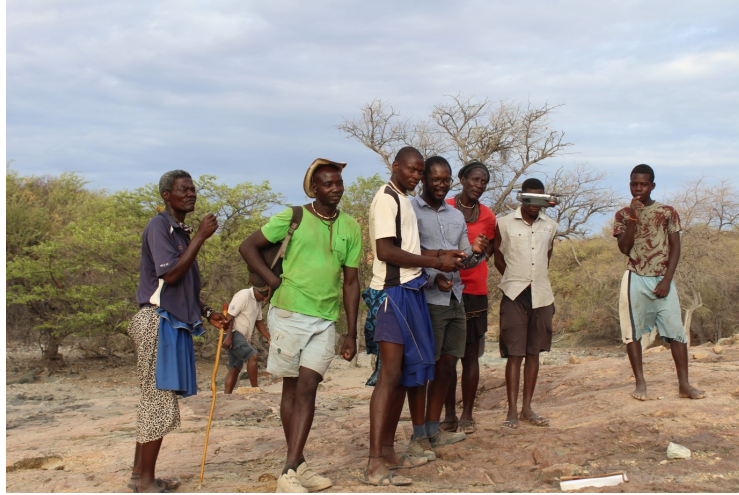
Fig. 6: Game guards and community members flying drone

servers, a data portal and computers for data storage will be hosted for data extraction, processing and transfer. The data will then be assessed by community members and replicated to cloud servers to enable remote access by different stakeholders such as the Ministry of Environment, conservation scientists, NGOs and law enforcement agencies for further action.