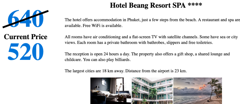
Fig. 1. Experiment screen showing the course of a single auction.

low NFC is beneficial for performance in the computerized sequential decision tasks, enabling older adults to be more flexible decision makers compared to their high NFC counterparts [26].