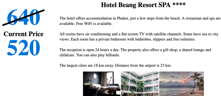
Fig. 1. Experiment screen showing the course of a single auction.

low NFC is beneficial for performance in the computerized sequential decision tasks, enabling older adults to be more flexible decision makers compared to their high NFC counterparts [26].