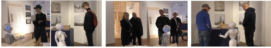
Fig. 2. Left: L-shaped F-formation; Center: Horseshoe arrangement; Right: Horseshoe arrangement with Pepper.