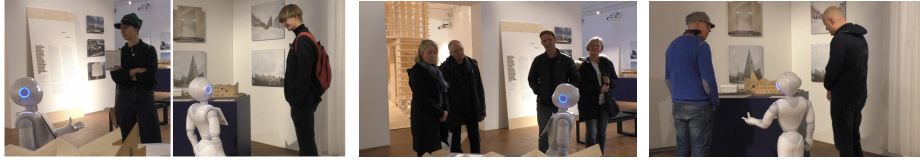
Fig. 2. Left: L-shaped F-formation; Center: Horseshoe arrangement; Right: Horseshoe arrangement with Pepper.