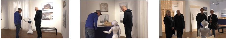
Fig. 3. Left: Circular F-formation with Pepper; Center: Participants leaning in to hear the robot better; Right: Participants smiling when interacting with the robot.

to the designated experiment area. Then, the robot would approach the group, greet them and ask if it could explain the Romsdal Folk model. Shortly after, the robot would ask participants to follow it towards the model to explain the specific exhibit. The entire test took 2 to 5 minutes to complete for each group, followed by a 3 minutes follow-up group interview.