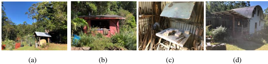
Fig. 1. Paul's (P4) garden and forest (a), the first house built in 1991 (b), the blacksmith workshop(c), the house they live in now (d)

“Because we are concerned about the issue of environmental protection, and then we do this (self-sufficiency). The environment and people are one, and we respect the environment as the primary prerequisite for doing this, so basically we consider the use of natural materials as much as possible.” (Will, P6)