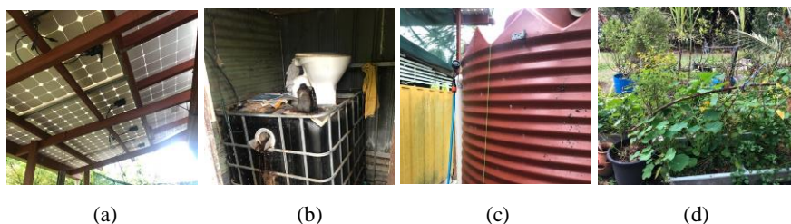
Fig. 3. Off-the-grid system in Martin's retrofitted house: (a) photovoltaic system, (b) biogas system, (c) rainwater collection, (d) edible garden

Thomas was an organic farmer and founded a community in 1975. He sold the farm due to the back injury, and now lives in a house with 800 square meters back-yard, which he called a small farm. He has been living a self-sufficient lifestyle for 45 years, growing his own food (Figure 3d), keeping native bees, cooking from gas that is produced in his own biogas system, making biochar, collecting rainwater (Figure 3c) and generating electricity from solar panels. Almost all of these alternative projects were made by waste and recycle materials. Such as he recently experimented and built an electric bike by recycled computer batteries. He sold his car and is completely reliant on his electric bike.