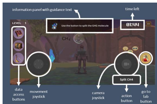
Fig. 2. Scheme of the Lemuria place interface

The character depicted in the information panel (Figure 2 – top center) is Auberon, who guides the player throughout the game, giving him clues and tips. In each game level, the player can talk to two other characters: Carol and Vinicius. Besides attributing missions to the player, Carol also shares her personal stories that aim to sensitize children to climate change using evidences (e.g. climate change impacts with animals and plants, climatic phenomena). Vinicius, a Lemuria activist, shares some tips and small individual practices to soften climate change, to be implemented on Earth, where there is no magic and which can be adopted by children.