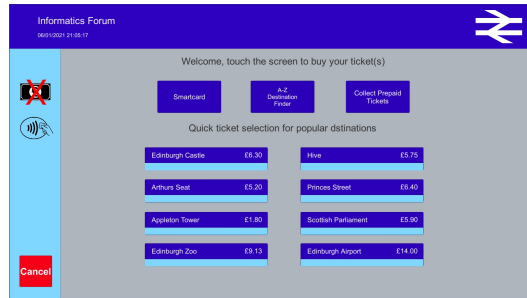
Fig. 2: Interface shown to participants.