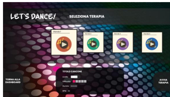
Fig. 1. Setting of initial parameter for the therapy.

The game session at the hospital involves the participation of 1 to 4 users that can share similar therapeutic goals about motor and cognitive abilities. Prior to the game session, the users carry out a warm-up phase, preparatory to the correct execution of rehabilitation activities. Based on the specific users involved, the therapist can set a number of initial parameters, such as the music track, the exercise duration and, most importantly, the therapeutic goals on which to focus the session (see Fig. 1).