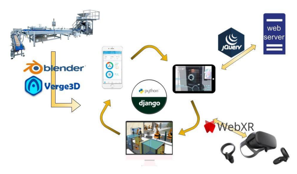
Fig. 1. The developed framework and workflow for the building of a digital twin.

As shown in Fig. 1, the workflow starts with the creation of a virtual model using Blender [1], a 3D Computer Graphics toolkit, where CAD and BIM models can be easily imported and simplified. Notwithstanding, Blender allows to obtain a faithful replica of the physical entity thanks to its several tools for realistic computer-generated imagery.