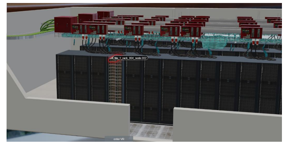
Fig. 3. User interaction and issue tracking in the data center digital twin.

virtual environment or, as shown in Fig. 2, to point to a production unit and click to show its status information panel.