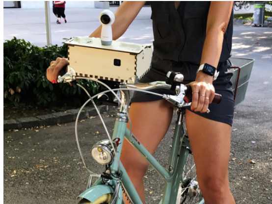
Fig. 1. The hardware iteration of the Virtual Cycling Coach used in the second evaluation round: Mounted on the handlebar, the casing housed a front-facing camera that live-streamed a video feed to the controlling researcher (the wizard), a smartphone with an attached loudspeaker for outputs of the audio interface, and a 360° camera on top for recording the session.

Ten adults living in Vienna were recruited using university mailing lists and via social media. Two of the participants were university students. Eight participants were female, two were male, age ranged from between 20 and 40 years. The evaluation study took place in Vienna over a period of eight weeks. The researcher instructed participants to ride for about 20 minutes without any more specific information regarding the route.