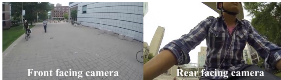
Fig. 3. Start of a session with the VCC in an area without motorized vehicles to reduce overall complexity of the context.

Furthermore, the VCC was designed to scaffold the learning experience for its users, e.g. by doing certain exercises in safe or less complex environments. Scaffolding was important for the challenge to be at the right level in relation to the competences of the participant, that is being not too easy but also not too hard. [42] A typical session therefore started in areas with little or no traffic from motorized vehicles, as shown in Figure 3. We could observe how this helped participants develop competencies like looking back while riding or riding with one hand on the handlebar to signal turns. “I didn’t look back much because I was scared. I thought that I would lose control. But after doing it a few times in a safe environment it was fine.” [Judd — follow-up interview — all names are changed for anonymity]