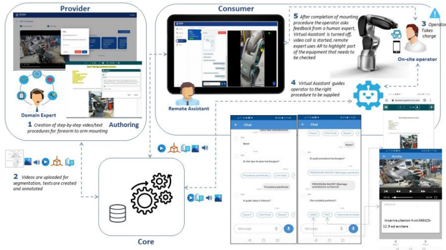
Fig. 2. Forearm to arm mounting scenario