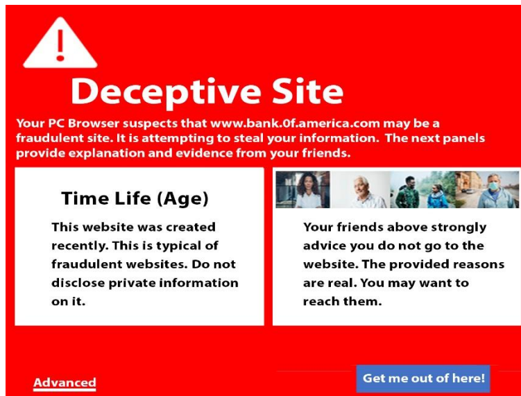
Fig. 3. Implementation of the personalized warning message mechanism

Fig. 3 shows how the mechanism has been implemented as a splash-screen displayed as soon as the user tries to access a deceptive website. On the left side, one of the variants of the warning message is shown, while the right panel aims at persuading the user to not proceed since the users' friends Joseph, Lucia, and Andrea strongly recommend that he should not proceed to the fake URL ( www.bank.Of.america.com ).