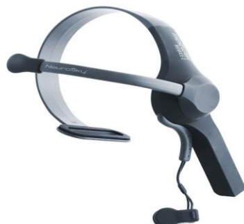
Fig. 3. The NeuroSky MindWave Mobile 2 used in the system.

The general workflow of the system usage is schematized in Fig. 4 . The dancer , wearing the NeuroSky MindSet headset, starts dancing. The device transmits every second her values of attention. The algorithm of Polyphony Generator module, depending on the intensity of the attention value, generates strings of rhythmic musical figures. For an high attention status, polyphonic voices are generated with smaller musical values such as quarter note, eighth note and sixteenth note and relative pause value. For low attention status, polyphonic voices with larger musical values such as whole note, half note and quarter note and relative pause values are generated. Given the attention value, the algorithm selects a set of rhythmic values and generates strings of rhythmic figures in a randomized modality.