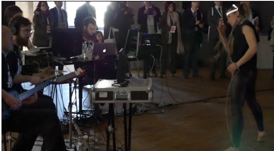
Fig. 1. An actual implementation of the proposed biofeedback system.

The relationship between various art forms is one of the fields of investigation that crosses all artistic disciplines, from musicians/composers to choreographers and theater or cinema directors. The interplay between music and dance has profoundly influenced composers of every era by creating new technical-compositional models both in the