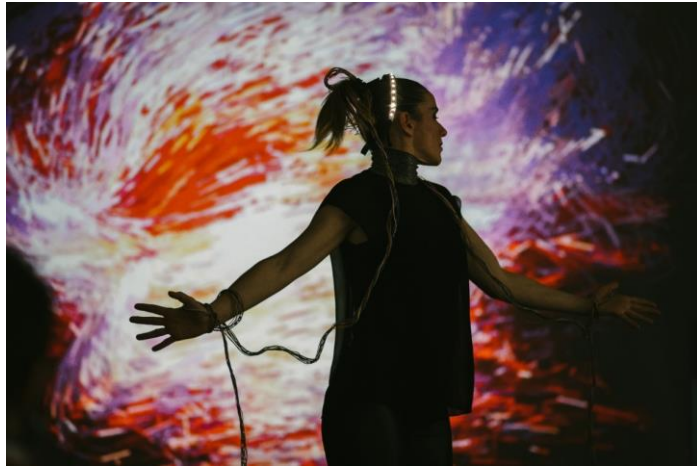
Fig. 2. Dancer wearing the BCI headset during a live performance. 1

In this paper, we propose the demonstration of a biofeedback system that puts in a choreographic/compositional relationship a dancer with a music composition software developed on purpose and two musicians. The dancer wears a NeuroSky MindSet device [2] that detects some neurologic parameters, in particular her attention values [3]. Depending on these values, the software generate a music polyphony that is presented on an electronic score to musicians, who play it. In turn, the music thus produced influences the mental status of the dancer, who will adapt her choreography according to what she hears, generating new polyphonic musical bars.