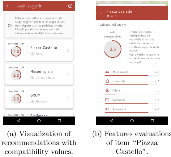
Fig. 1: User interface of the PIUMA app - personalized recommendations.

lack such information, a possible solution is that of acquiring sensory features directly from people, a task that perfectly fits the previously discussed user empowerment goal.