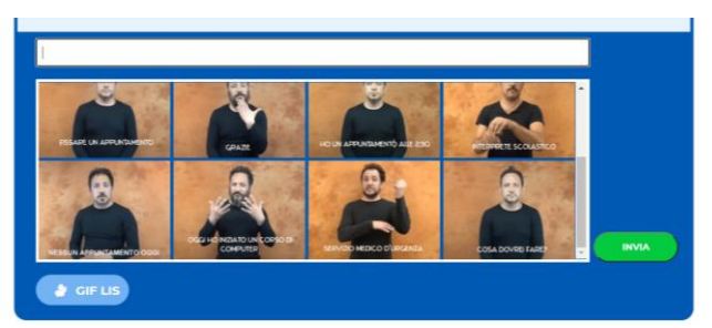
Fig. 2. A subset of a SL GIFs gallery

The GIFs gallery layout is in line with the common grid outline used for the AAC systems, in which the symbols are in specific positions within a grid (see Figure 2). As each symbol is isolated, it supports the recall of the individual contents of each cell [12]. The use of GIFs representing SL movements grouped in a gallery is an interesting PECS-based methodology that can be great benefit to the Deaf community.