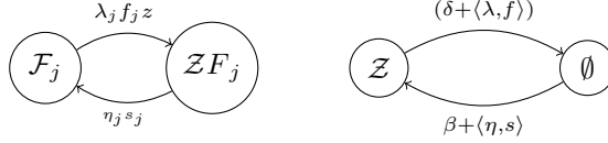
FIGURE 1. Transitions of Pairing Mechanism, with s = (s_j) \stackrel{\text{def.}}{=} (C_{j,N} - f_j) .

Stochastic Differential Equations. The process (X_N(t)) = (F_N(t), Z_N(t)) is represented as the solution of a system of SDEs (Stochastic Differential Equations). On the probability space there are 2(J+1) independent Poisson processes on \mathbb{R}_+^2 with intensity measure dx \otimes dt , \mathcal{P}_z^+ , \mathcal{P}_z^- , \mathcal{P}_j^+ , \mathcal{P}_j^- , j=1, \dots, J . See Rogers and Williams [26] for example. The underlying filtration (\mathcal{F}_t) is defined by, for t > 0 ,