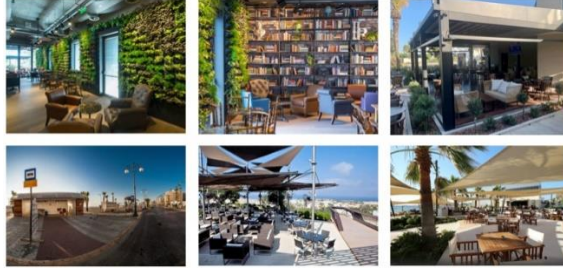
Fig. 1. A subset of pictures used in the human attack study illustrating sceneries in which participants share common experiences.