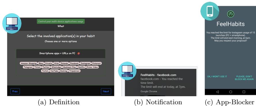
Fig. 1. FeelHabits is a multi-device DSCT targeting PCs and smartphones. Through a dedicated Google Chrome extension (a), the user can define an intention , i.e., a temporal and/or launch limit, for her different devices. When intentions are not respected, FeelHabits can send notifications on the device that is currently in use (b), or it can block the access to specific websites or apps (c).

In an initial implementation of FeelHabits , composed of a mobile app and a Google Chrome extension, a user can define these intentions by targeting her PC and her smartphone (Figure 1(a)). Intentions can be defined for the overall multi-device usage of the user ( device-level intentions), or they can be restricted to the usage of specific services available both on the PC and on the smartphone ( app-level intentions), e.g., a social network that can be accessed through the browser and a dedicated mobile app. Furthermore, intentions can be linked to specific temporal contexts, e.g., the time of the day. FeelHabits then monitors the multi-device usage of the user, and it can use different level of severity when intentions are not respected, from simple notifications alerting the user of a reached limit on a given device (Figure 1(b)) to app-blockers (Figure 1(c)).