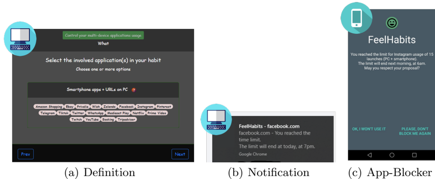
Fig. 1. FeelHabits is a multi-device DSCT targeting PCs and smartphones. Through a dedicated Google Chrome extension (a), the user can define an intention , i.e., a temporal and/or launch limit, for her different devices. When intentions are not respected, FeelHabits can send notifications on the device that is currently in use (b), or it can block the access to specific websites or apps (c).

In an initial implementation of FeelHabits , composed of a mobile app and a Google Chrome extension, a user can define these intentions by targeting her PC and her smartphone (Figure 1(a)). Intentions can be defined for the overall multi-device usage of the user ( device-level intentions), or they can be restricted to the usage of specific services available both on the PC and on the smartphone ( app-level intentions), e.g., a social network that can be accessed through the browser and a dedicated mobile app. Furthermore, intentions can be linked to specific temporal contexts, e.g., the time of the day. FeelHabits then monitors the multi-device usage of the user, and it can use different level of severity when intentions are not respected, from simple notifications alerting the user of a reached limit on a given device (Figure 1(b)) to app-blockers (Figure 1(c)).