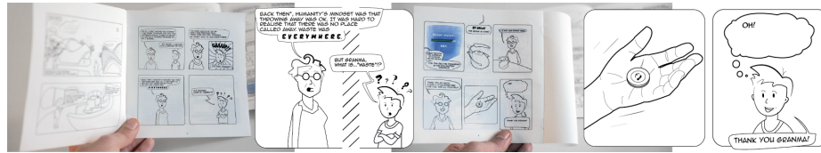
Fig. 3. Left: The comic's main characters, discussing the anachronistic notion of waste. Right: The last two panels of the comic booklet with a narrative peak ending.

In the first episode of the Materialverse, the grandmother requests help in repairing her kettle with the MatterMix; a futuristic technological device that can manufacture or repair any device, or dismantle it into raw solid matter. We utilise the characters' dialogue to construe what changed from nowadays to 2070 and the eradicated concept of waste (See Figure 3, left).