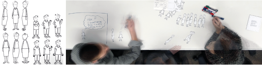
Fig. 4. Left: Paper cut-outs assortment of the two main comic characters, used to support a co-speculation activity during the expert workshop. Right: Expert workshop, participants co-creating an alternative ending using comic character cut-outs.