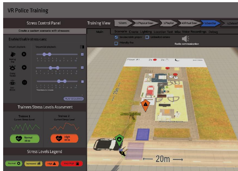
Fig. 1. Stress cue live editor showing stress levels of trainees and selected stress cues and control panel to add (1) single stress cues, (2) stress cues in parallel, or (3) in a sequence. Screens based on existing software by the VR partner RE-liON in SHOTPROS.

The question of how the training experience can be improved in the complex context of police work with stress cues guided the development of the prototype. Based on design ideas and feedback in the co-creation process, we prototypically integrated ideas for trainer interactions with the stress cues into the VR training system developed in SHOTPROS (see Fig. 1). The end user requirements revealed that an efficient, effective interaction and easy-to-use user interface design is needed. It allows for observations of the training and trainees' behavior and adaptations to the scenario by (de)activating stress cues rapidly with little mental effort.