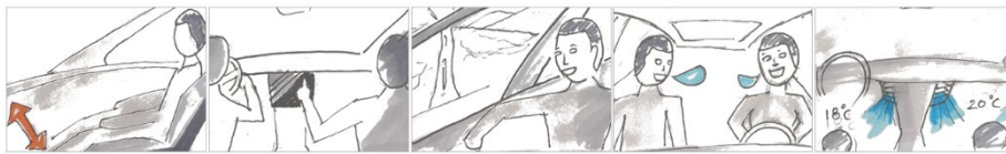
Fig. 1. In a repertory grid study, we identified major factors of a convenient car ride: Our results show the importance of physical space, shared controls, the ability to view the landscape, communication, and personalization (from left to right).

m.berger@tue.nl, b.pfleging@tue.nl, r.bernhaupt@tue.nl