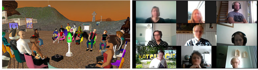
Fig. 1. Two alternative approaches to online conferencing, using avatars in Second Life (left) and video streams in Zoom (right).

system which provided support for a large number of participants is Zoom [19], which since 2020 has emerged as the most widely used platform for group meetings [9]. As such, the most commonly seen image of online conferences these days is with Zoom in its “Gallery” view, in which the screen is divided into a grid of separate video images – a grid of video talking heads (see Figure 1, right).