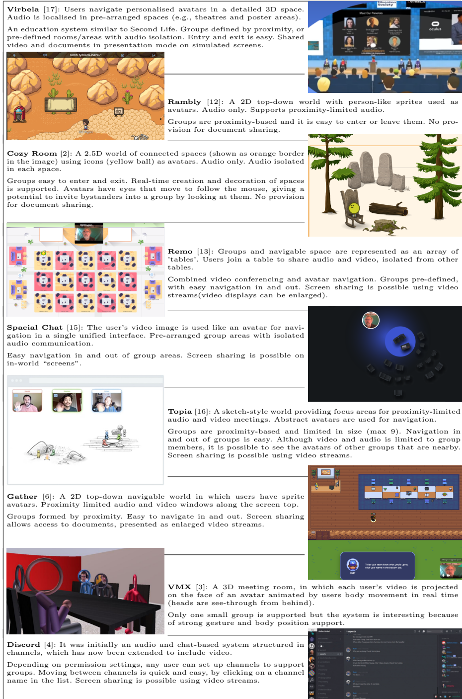
Table 1. Summary of the reviewed online conferencing systems.