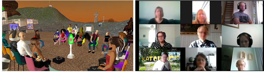
Fig. 1. Two alternative approaches to online conferencing, using avatars in Second Life (left) and video streams in Zoom (right).

system which provided support for a large number of participants is Zoom [19], which since 2020 has emerged as the most widely used platform for group meetings [9]. As such, the most commonly seen image of online conferences these days is with Zoom in its “Gallery” view, in which the screen is divided into a grid of separate video images – a grid of video talking heads (see Figure 1, right).