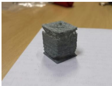
Fig. 3 – Printed piece