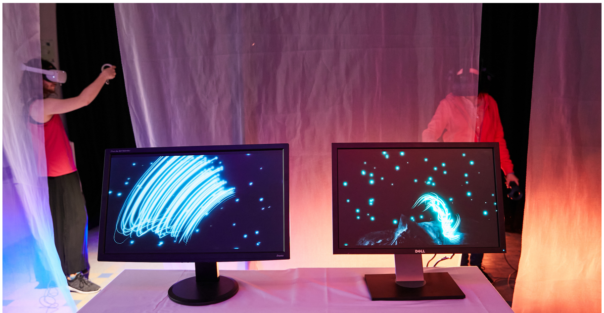
Fig. 4: Creative Harmony in the Recto VRso festival in Laval Virtual