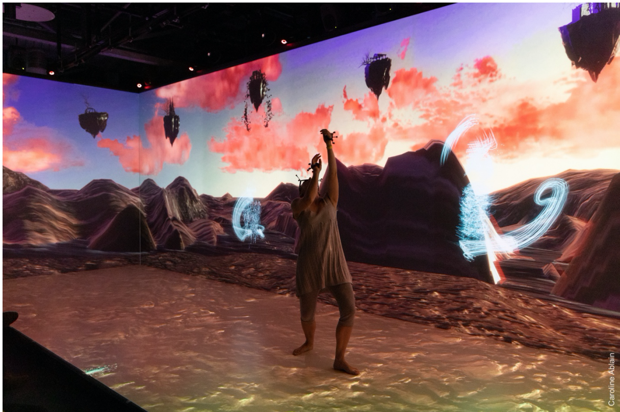
Fig 2. The Creative Harmony landscape in the co-creation scene

The collaborative artwork “Creative Harmony” was designed within a multidisciplinary team of artists, researchers and computer scientists from different laboratories. The “Creative Harmony” experience is based on a live performance that involves a dancer, a musician, and collaborative spectators who are engaged to the experience through full-body movements. The performance is structured around three phases, one introductive meditative phase to discover the universe of “Creative Harmony”, one active phase of co-creation of a shared landscape whose aesthetic is inspired by the German Romanticism painting from 19 th century (Fig. 2), and a last phase of contemplation of the co-created landscape. In order to foster co-presence, each participant of the experience is associated to an avatar that aims to represent both its body and movements. The music is an original composition designed to develop a peaceful and meditative ambiance to the universe of “CH”.