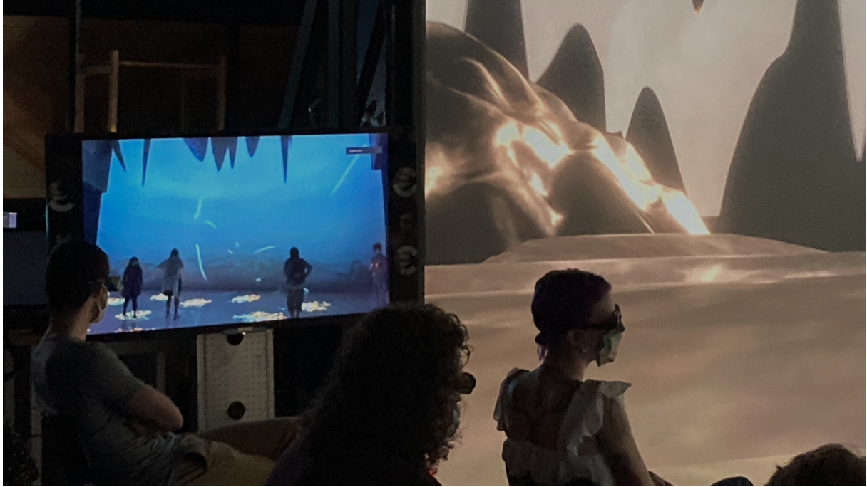
Fig. 3: Creative Harmony in Ars Electronica's Deep Space