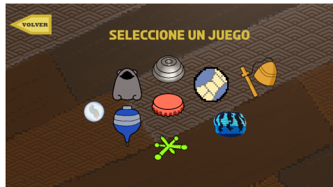
Fig. 2. Game Gallery

It should be noted that, both in story campaign and in the game gallery the player can pause the microgame to access additional information about the microgame that is currently paused or to return to the main menu.