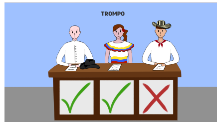
Fig. 1. Act two of the story campaign

Each act involves a series of pseudorandomly selected microgames, which are sequentially presented to the player, and a finite amount of life points. A life point is taken each time the player loses at a microgame. If the player manages to complete a certain number of microgames without depleting all life points, they will complete the act and gain access to the next one, with exception of the third act. In this final act, the player will instead be given the option to keep playing at an incremental difficulty, in order to achieve the highest score possible. These scores will be ranked and displayed in a global leaderboard.