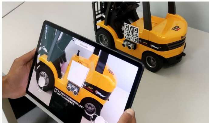
Fig. 2. Initial Mock-up UI (Joysticks Controllers and Exit Button)

Vuforia is an Augmented Reality (AR) software development tool-kit is used to create dynamic user experiences. Vuforia utilises computer vision technology to see 3D objects in a real environment and is used to place virtual objects using camera viewfinders and positions objects in real surroundings. Using AR Camera GameObject from Vuforia is mainly used to realise augmented reality.