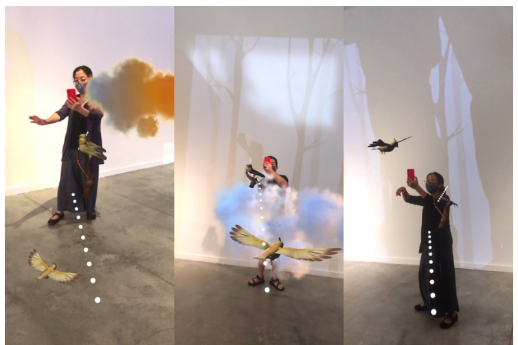
Fig. 2. In-game screenshots of "The Woods"

ers must choreograph their movement and, by extension, the branch to provide a perch for the virtual birds to land on. The game checks for collisions between the branch and two other virtual objects. If a collision occurs between the branch and a bird, then the bird will land on the branch and a new fragment of the aforementioned voicemail will play. Alternatively, if a collision occurs between the branch and a storm cloud, then a crash of thunder erupts, and any birds that had been caught scatter and fly away. Moreover, the flight path of the birds and clouds are randomly generated to maintain interest and avoid players exploiting the game. As a metaphor, these game mechanics are designed to parallel the narrative of the isolated brothers who are navigating their own obstacles in order to reconnect with one another.