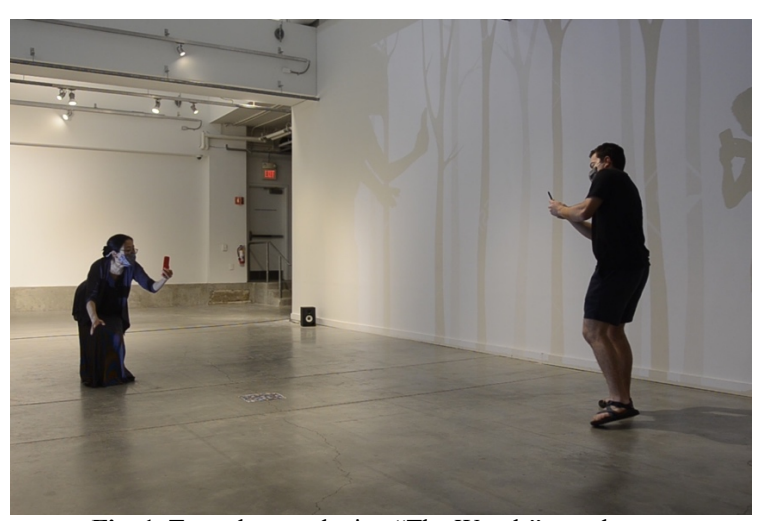
Fig. 1. Two players playing "The Woods" together

The narrative of "The Woods" is built around the broken relationship of two adult brothers who have been separated and out of contact with each other for a considerable amount of time. One of the brothers in a desperate attempt to reach out and reconcile with the other brother is heard leaving a voicemail. In the beginning of the game, players hear only fragments and distorted chunks of the message and are unable to decipher meaning or intent. However, as the game progresses through player collaboration, the message becomes clearer. This narrative of reconciliation between these estranged brothers informs the mechanics of the game itself, with the players coordinating their efforts to one another in pursuit of a common goal. The game is designed such that it is not enough for one player to do all of the work. Rather, success requires the combined work of both players. As players engage one another and contribute to the goal together, the game rewards them with the unfolding narrative of the brothers reconnecting to one another (see Figure 1).