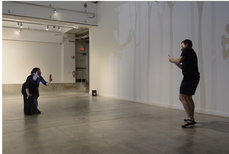
Fig. 1. Two players playing “The Woods” together

The narrative of “The Woods” is built around the broken relationship of two adult brothers who have been separated and out of contact with each other for a considerable amount of time. One of the brothers in a desperate attempt to reach out and reconcile with the other brother is heard leaving a voicemail. In the beginning of the game, players hear only fragments and distorted chunks of the message and are unable to decipher meaning or intent. However, as the game progresses through player collaboration, the message becomes clearer. This narrative of reconciliation between these estranged brothers informs the mechanics of the game itself, with the players coordinating their efforts to one another in pursuit of a common goal. The game is designed such that it is not enough for one player to do all of the work. Rather, success requires the combined work of both players. As players engage one another and contribute to the goal together, the game rewards them with the unfolding narrative of the brothers reconnecting to one another (see Figure 1).