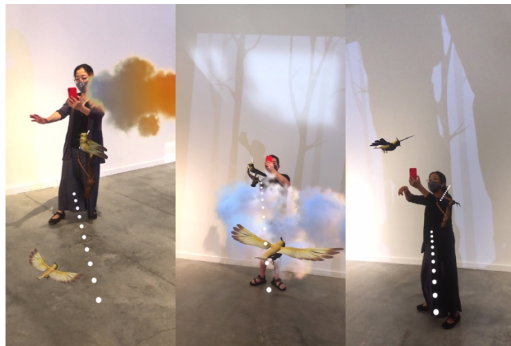
Fig. 2. In-game screenshots of “The Woods”

ers must choreograph their movement and, by extension, the branch to provide a perch for the virtual birds to land on. The game checks for collisions between the branch and two other virtual objects. If a collision occurs between the branch and a bird, then the bird will land on the branch and a new fragment of the aforementioned voicemail will play. Alternatively, if a collision occurs between the branch and a storm cloud, then a crash of thunder erupts, and any birds that had been caught scatter and fly away. Moreover, the flight path of the birds and clouds are randomly generated to maintain interest and avoid players exploiting the game. As a metaphor, these game mechanics are designed to parallel the narrative of the isolated brothers who are navigating their own obstacles in order to reconnect with one another.