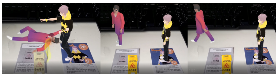
Fig. 2. Animation under AR device when two cards are paired correctly