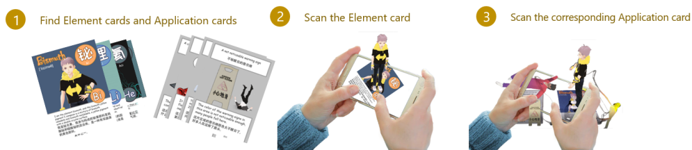
Fig. 3. Three steps of play

ChemiKamiAR can be played single-player or multi-player. For a single-player, there is no tension of competition. It takes three steps to complete each task, as shown in figure 3. The key to completing the game task is to find the right connection between chemical elements and their application.