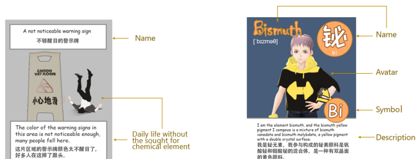
Fig. 1. The application card (left) and the role card (right), which are available in both English and Chinese

Players will be introduced to two kinds of cards: an Element card and an Application card. Both cards can be scanned by a phone individually or side by side, and show a 3D overlay with an animation. The application card is about a real-life application domain that requires one of the chemical elements. For example, it could show a sign without any color, which then needs an element that often exists in pigment (Figure 1, left). Scanning the Application card alone, players would see a scene of daily life without the existence of a certain chemical element (in this case a sign that is not very visible). The Element card is designed with a picture of the avatar representing the element, the name, and a short description of that chemical element. Scanning the Element card alone, players will see an avatar representing the element, introducing themselves with the description printed on the card. By reading or listening to that description, players can find hints for pairing the Element card and the Application card, e.g., Bismuth is an element in the Bismuth yellow pigment (Figure 1, Right). Reading this description, players may find this chemical element can play a role in the card of “the sign with no color.”