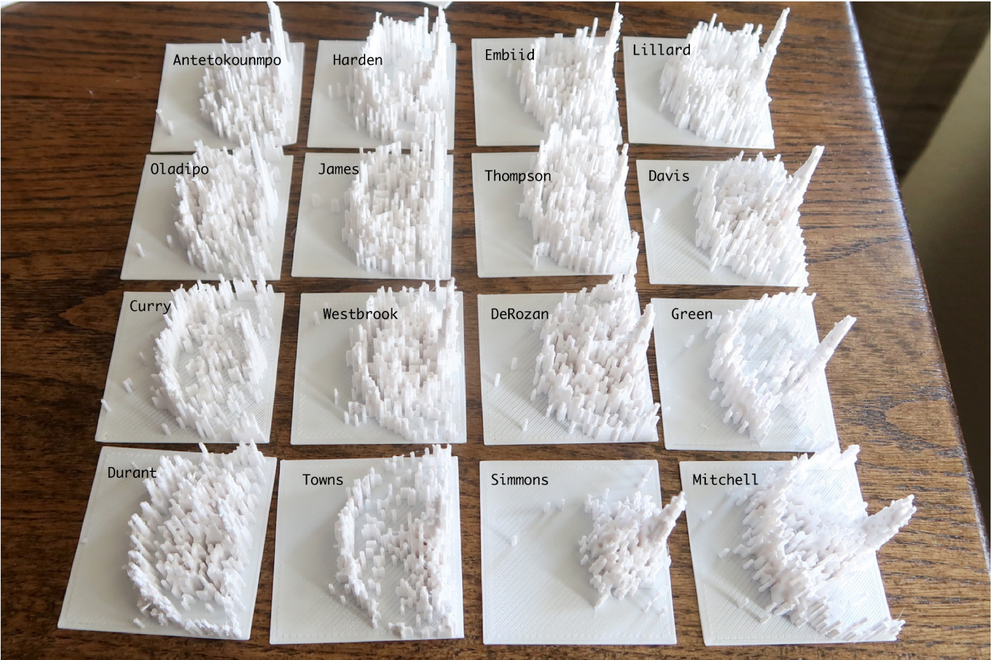
▲ Figure 5 Nathan Yau's physical charts showing per-player NBA shot selection data. | Credit: Nathan Yau.

Physicalizations can also simply serve personal curiosity, such as the ones shown in Figure 4, made by Nathan Yau, who generated physical charts from shot position data of key players of the NBA in 2018. He wrote code to transform NBA data from a player into a physical shape and—similar to the physicalizations of personal data above—ran the same code for different players to generate different physicalizations that can be physically organized and compared.