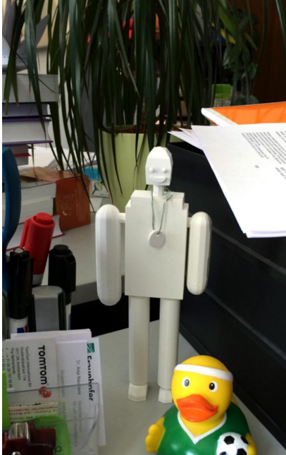
▼ Figure 4 Idem. | Credit: Simon Stusak.