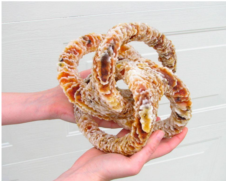
◀ Figure 1 A 3D model called Sugar Soliton created by Windell Oskay after the original model by Batsheba Grossman printed using sugar which turned partially into caramel giving it an appearance of a coral

need to be explored and many decisions made until finally an object emerges. Due to the intrinsic physics of a desired geometry and a chosen fabrication process, the resulting artifact does not necessarily come out as one expected (as Stephen Barrass discusses in his chapter on the Chemo Singing Bowl ). In most cases, some additional manual intervention is needed, most commonly to assemble or paint what comes out of a machine. The five chapters in this section all rely on digital production, and each one tells a different story combining different levels of manual and digital craft.