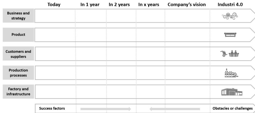
Fig. 2. Framework for strategic roadmapping towards Industry 4.0

dimension, subsequently breaking it down into objectives for the coming years as well as concrete projects and activities to reach those objectives. Afterwards, all objectives and activities are aligned in order to ensure that they support each other e.g. by looking at dependency, where some activities or objectives need to be reached before another project can be started. It also ensures a good distribution of projects and activities over time so that the roadmap is feasible to implement.