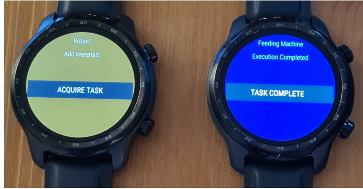
Fig. 2. Photo of the task coordinator app running on two smartwatches. The smartwatch on the right hand side displays a "normal" task. The smartwatch on the left hand side displays an "acquired" task which is currently being performed by the worker.

investment is expected to be made by the companies for using the device. The artefact competes with current solutions commercially available, by having an open source design which anyone can use as-is or further develop to fit individual use-cases, without having to engage into long-term commitments with an external know-how supplier [6].