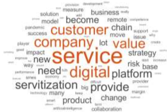
Fig. 3. General wordcloud

Some of the most used words are directly linked to the 4 statements under discussion, while other words show additional themes that emerged during the discussion: customer, platform, IoT, remote, chain, risk, and AI. This underlines how digitalization and collaboration are the most interesting topics and will characterize the new research trends.