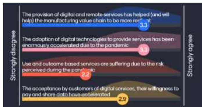
Fig. 2. Statement instant poll results

The discussion started with the four topics, but the panellists discussed several aspects of digital servitization and pandemic in a divergent way. Some topics were touched upon multiple times in support of the different statements. As previously mentioned, to really extract the main topics characterizing the impact of the pandemic on the digital servitization and the new normal trends, LDA analysis on the transcript was performed. A summary of the main findings is described in the following.