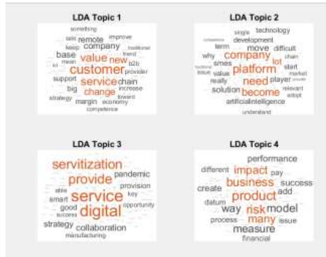
Fig. 4. LDA topics word cloud

The four topics obtained from the LDA are: