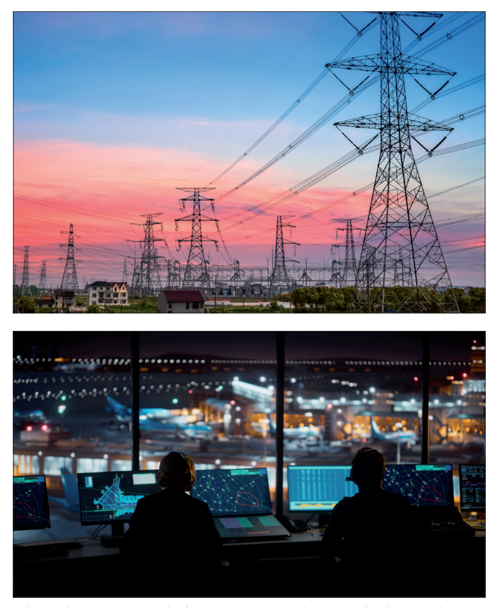
Cyberattacks now target critical infrastructure in areas such as energy distribution and air traffic control

Outside of a lab, the first publicly acknowledged successful cyberattack on a