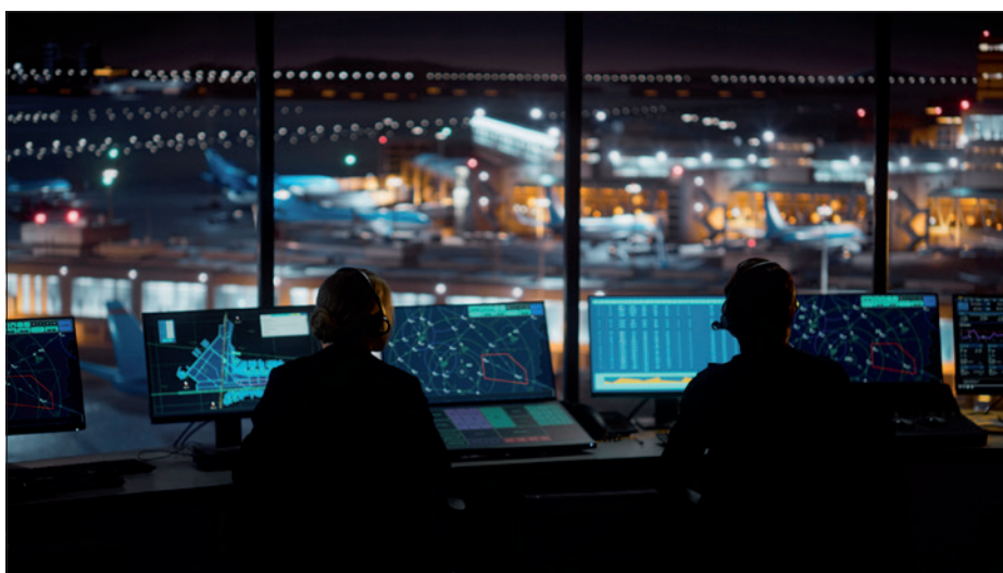
Cyberattacks now target critical infrastructure in areas such as energy distribution and air traffic control