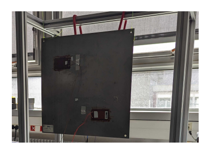
Fig. 1. Experimental vibrating testbed

We are targeting Structural Health Monitoring (SHM) applications and have begun working with a dataset containing three mechanical physical signals from a vibrating system, built for a previous research [7] at the Ampere laboratory.